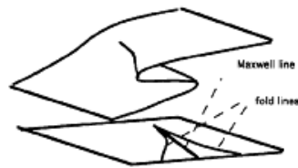
Figure 2.1: Cusp catastrophe