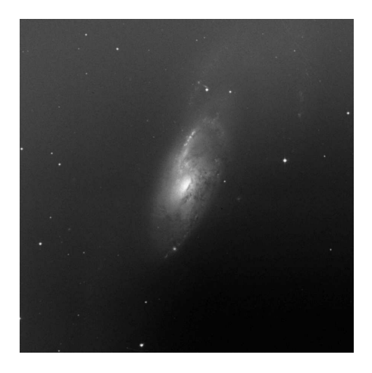
Figure 1: NGC 4258. [6]