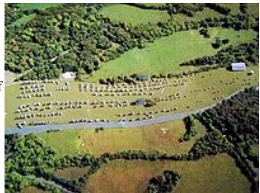
stone alignments at Carnac, Brittany

Stone Alignments and Circle Formations: We believe that the mystery of Stonehenge is intimately linked to the many stone alignments and circle formations to be found in many other places in Europe and indeed of the world. We consider the physical features of these stone formations that can be directly observed on site. We examine such stone alignments in the Brittany area of France, closest geologically and geographically to Stonehenge. These stone alignments, for example in Carnac, Brittany, are nearly straight lines and parallel (with some deviations at places). The spacing between rows is nearly uniform and equal.