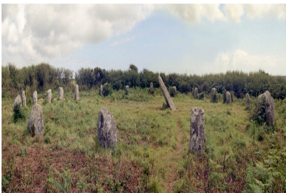
Boscawen-un Circle, Cornwall, UK

Avebury is the largest stone circle in the world: it is 427m (1401ft) in diameter covers an area of some 28 acres (11.5 ha). ... a huge circular bank (a mile round), a massive ditch now only a half its original depth, and a great ring of 98 sarsen slabs enclosing two smaller circles of 30 stones each and other settings and arrangements of stones. The outer bank, still very impressive, was originally 17m (55ft) high from ditch bottom to bank top. The stones, each weighing about 40 tons or more,