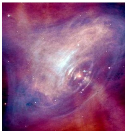
FIG. 4. b) Centre Left. Toroid black holes are scalable. Centre of the Crab Nebula I.R. note the weak gas jet.

The ions themselves represent the inertial mass needed for equivalence with gravitational mass, and are the mass of that gravity, which really does increase with motion through the vacuum CMBR frame, as in [particle accelerators, where the search for dark matter appears to have been hampered by the unrecognised dark matter photoelectrons.