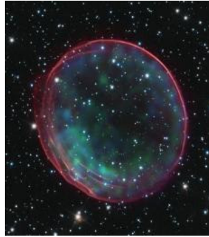
FIG. 2. The expanding Plasma Bubble in the Large Magellanic Cloud; NASA, ESA, Hughes.

that emitted by each one of a progression of particles, the scattered signal from each travelling at 'c', but the sequence gives an apparent c^1 = c/n + v_p . This is entirely allowable without breaching either SR postulate as it is moving in a different field and nothing breaches the limit 'c' in reality. A different observer frame allows this.