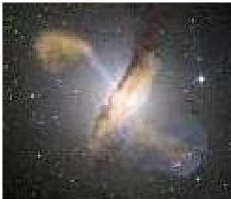
Fig.1 NGC 5128 Centaurus A (ESO. APEX) The sub mm. Radio source is from the receding gas jet. Note the plasma cloud around the jet.

The smbh expends itself by consuming the whole galaxy, but then is re formed and starts rotating on the new axis perpendicular to the jets, restarting the galactic cycle. The plasmasphere around the black hole remains, (and as it has a refraction co-efficient light passes through it at c/n ) The Sphere, perhaps up to many thousand light