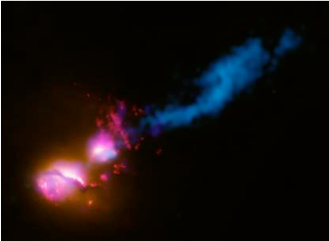
Figure 1. "Death Star Galaxy" (3c321), Credit: X-ray: NASA/CXC/CfA/D.Evans et al.; Optical/UV: NASA/STScI; Radio: NSF/VLA/CfA/D.Evans et al., STFC/JBO