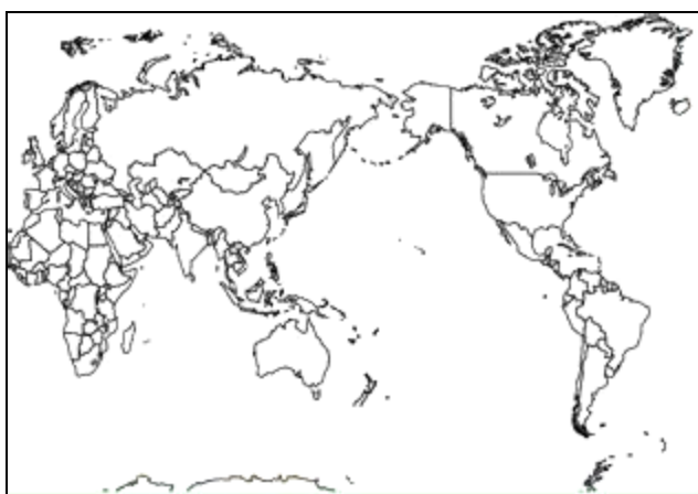
Figure 2 A black and white world map

Figure 2 is a black and white world map.