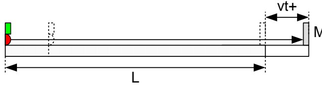
Fig.2 shows the propagation of photons in the direction of rod motion. Photons were emitted from the red LED. The mirror moves the distance equal to vt+ before the photons reach it. For the return path the detector moves the distance vt- before the reflected photons from the mirror M reach it.

For the length contraction formula derivation the photon clocks can also be used. In this case the photons propagate in parallel along the length of the moving rod of length " L ". The LED and the mirror are arranged as shown in Fig.2.