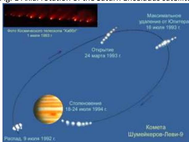
Fig. 2. Orientation of splinters of a comet Shumeykerov - Levi – 9