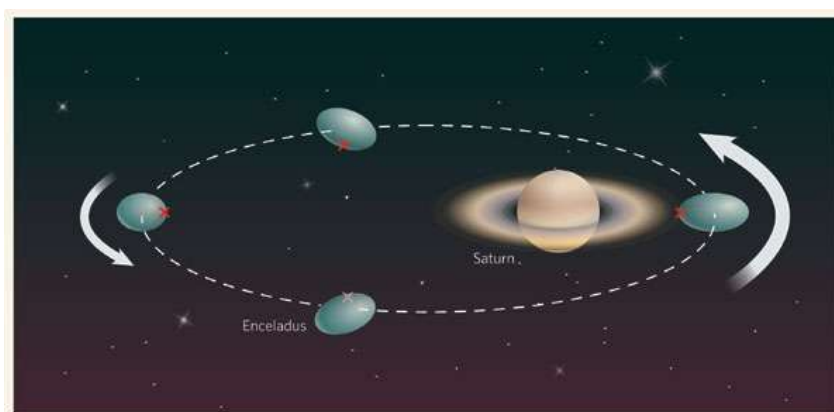
Fig. 1 Axial rotation of the Saturn Enceladus satellite