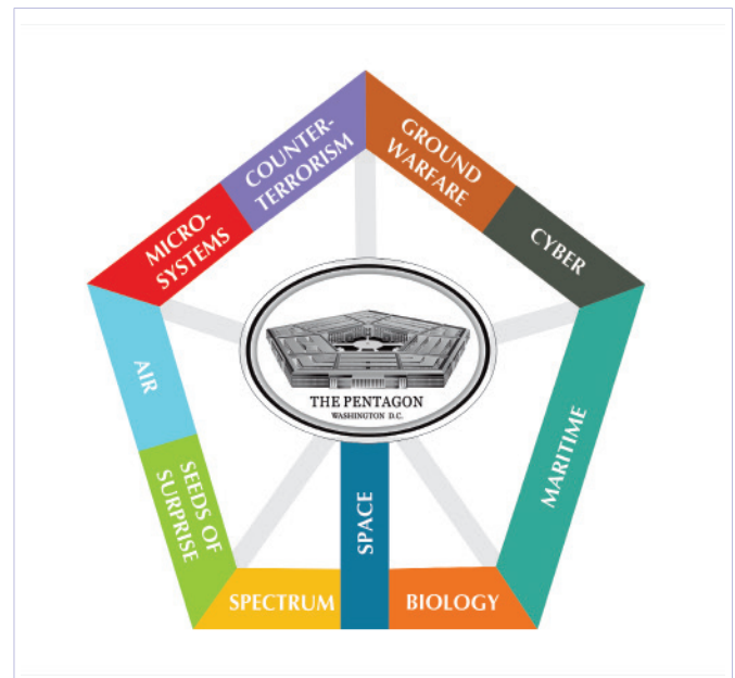
Figure 3: DARPA Demo day depicting convergence approach [25]

Several start-ups are working in this direction onto clinical trials which can pave way for the cure of belligerent types of breast cancers which gravitates to onslaught the tender youth women folks. DARPA conducted a demo day [25] to exhibit products evolved of convergence approach in Pentagon (Figure-3).