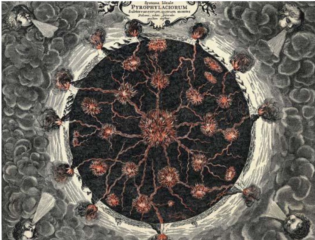
Fig. 1 Earth internal fires. From Athanasius Kircher: Mundus Subterraneus , 1665

keywords: seismic wave propagation, liquid Earth's core, liquid Earth's mantle, fast spinning Earth's core, Earth Crust Displacement theory