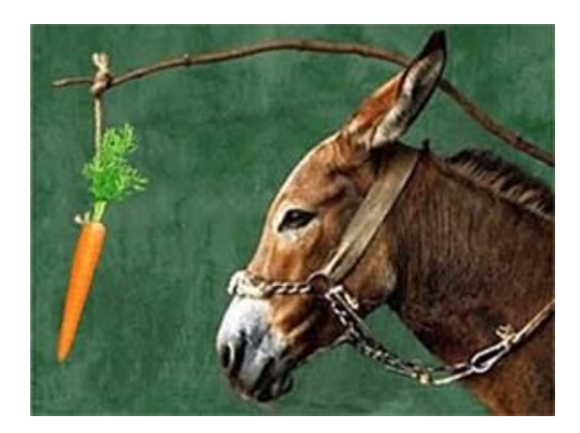
Fig. 10, p. 11 in CEN.pdf

If you are not interested in Mathematics and theoretical physics, and are only curious about the basic principle of the physics of life, check out p. 4 and the continuum on p. 39 in the "manual". The quantum-gravitational, atemporal , and pre-geometric Res potentia springs "within" every geometric point/event, that is, "between" photon's emission and absorption (Kevin Brown). Its duration, recorded with a physical clock, is zero – read the Greek story on p. 31 therein. In the so-called Arrow of Space, 'time' comes from both 'change in space' (the coordinate time, recorded with clocks) and 'change of space'. The latter is completely nullified, being "inside" every geometric point/event. Hence we have perfect (Sic!) spacetime continuum in the light cone, whereas the Platonic Res potentia is shifted to the potential future (see the carrot below). It is accessible only to the living and quantum-gravitational world (p. 7). All you need is a brain. You don't have to learn exotic techniques like meditating on a rock or solving differential equations: spacetime engineering works like a black box (p. 43; see also Slide 14).