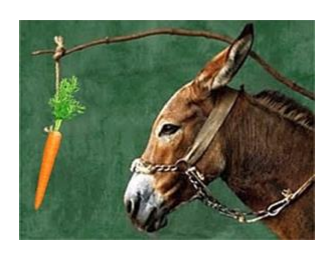
Fig. 10, p. 11 in CEN.pdf You only have to swing the carrot (potential future) toward your desired destination, and the donkey will carry you and the cart there.

If you are not interested in Mathematics and theoretical physics, and are only curious about the basic principle of the physics of life, check out p. 4 and the continuum on p. 39 in the "manual". The quantum-gravitational, atemporal , and pre-geometric Res potentia springs "within" every geometric point/event, that is, "between" photon's emission and absorption (Kevin Brown). Its duration, recorded with a physical clock, is zero — read the Greek story on p. 31 therein. In the so-called Arrow of Space (p. 7), time comes from both 'change in space' (the coordinate time, recorded with clocks) and 'change of space'. The latter is completely nullified, being "inside" every geometric point/event. Hence we have perfect (Sic!) spacetime continuum in the light cone, whereas the Platonic Res potentia is shifted to the potential future (see the carrot below). It is accessible only to the living and quantum-gravitational world (p. 7). All you need is a brain. You don't have to learn exotic techniques like meditating on a rock or solving differential equations: spacetime engineering works like a black box (p. 43; see also Slide 14).