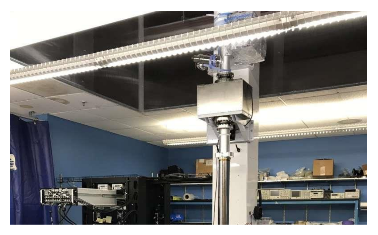
The Goddard-AOSense team built this terrestrial proof-of-concept gravity gradiometer.

Atom interferometry, however, hinges on quantum mechanics, the theory that describes how matter behaves at sub-microscopic scales. Atoms, which are highly sensitive to gravitational signals, can also be cajoled into behaving like <u>light waves</u>. Special pulsing lasers can split and manipulate atom waves to travel different paths. The two atom waves will interact with gravity in a way that affects the interference pattern produced once the two waves recombine. Scientists can then analyze this pattern to obtain an extraordinarily accurate measure of the <u>gravitational field</u>.