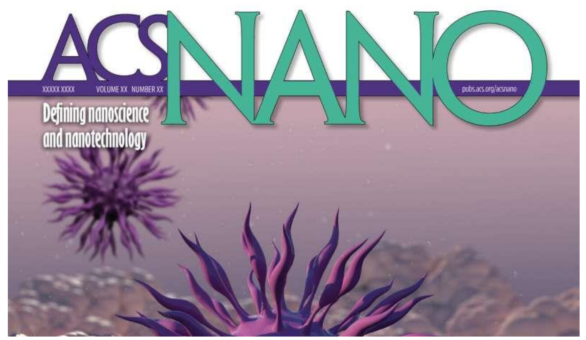
OSU researchers Olena and Oleh Taratula's work with magnetic nanoclusters as cancer therapy was featured on the cover of ACS Nano.

Olena Taratula and Oleh Taratula of the OSU College of Pharmacy tackled the problem by developing nanoclusters, multiatom collections of nanoparticles, with enhanced heating efficiency. The nanoclusters are hexagon-shaped <u>iron oxide nanoparticles</u> doped with cobalt and manganese and loaded into biodegradable nanocarriers.