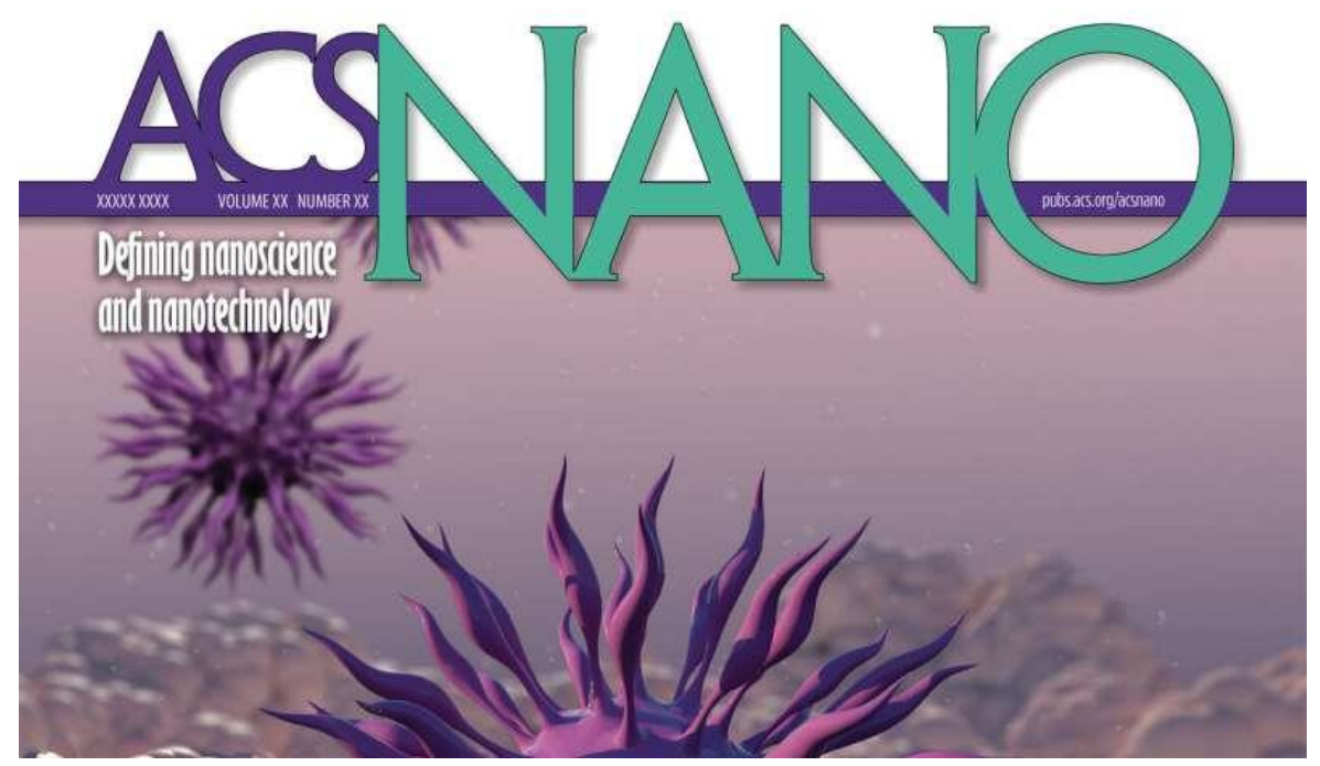
OSU researchers Olena and Oleh Taratula's work with magnetic nanoclusters as cancer therapy was featured on the cover of ACS Nano.