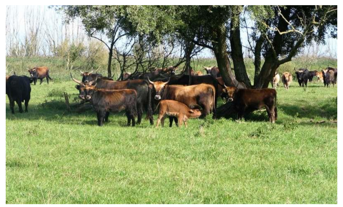
The Oostvadersplassen is a nature reserve close to Amsterdam in the Netherlands. Covering 56 sq km, this polder was created in 1968 as a haven for birds, but large herbivores were later introduced to reduced shrub cover.

Nuno Cesar De Sa from Leiden University explains, "I am interested in developing <u>remote-</u> <u>Sensing</u> methods to capture the 'plasticity' of vegetation species—so traits such as plant height and leaf size—with respect to herbivore pressure.