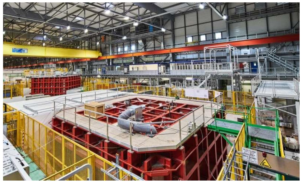
The outer structures (red) for two prototype DUNE detectors that are currently being evaluated at CERN.

The solution? Go 5,000 feet underground, build four 10-kiloton detectors filled with liquid argon, and fire a beam of <u>neutrinos</u> made in a particle accelerator that's 800 miles away. This is the eventual goal of DUNE, an international neutrino research facility run by Fermilab, a particle physics and accelerator laboratory near Chicago. Excavations for the detector, which will be installed at the Sanford Underground Research Facility in South Dakota, are underway, and researchers are now busy with experiments before the first detector is installed in 2022.