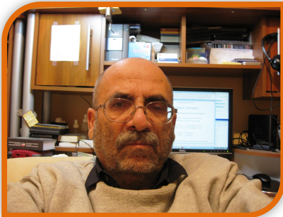
My scientific work place (06-Dec-2015)