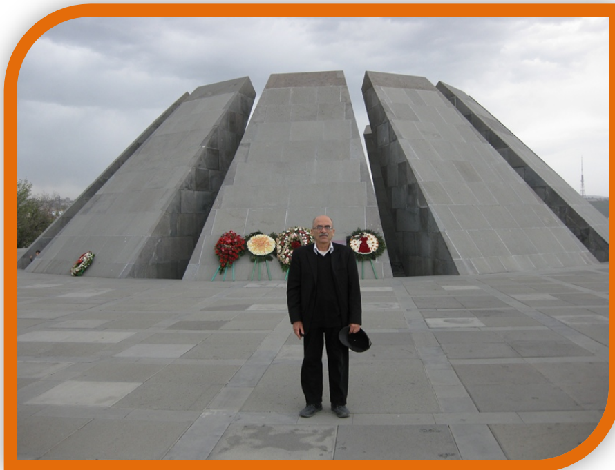
I am a grandson of surviving victims of the Armenian Genocide (22-Apr-2017)