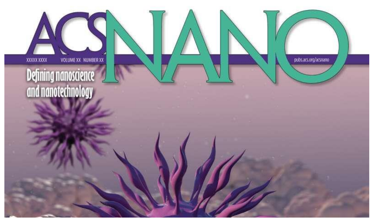
OSU researchers Olena and Oleh Taratula's work with magnetic nanoclusters as cancer therapy was featured on the cover of ACS\ Nano .

Olena Taratula and Oleh Taratula of the OSU College of Pharmacy tackled the problem by developing nanoclusters, multiatom collections of nanoparticles, with enhanced heating efficiency. The nanoclusters are hexagon-shaped <u>iron oxide nanoparticles</u> doped with cobalt and manganese and loaded into biodegradable nanocarriers.