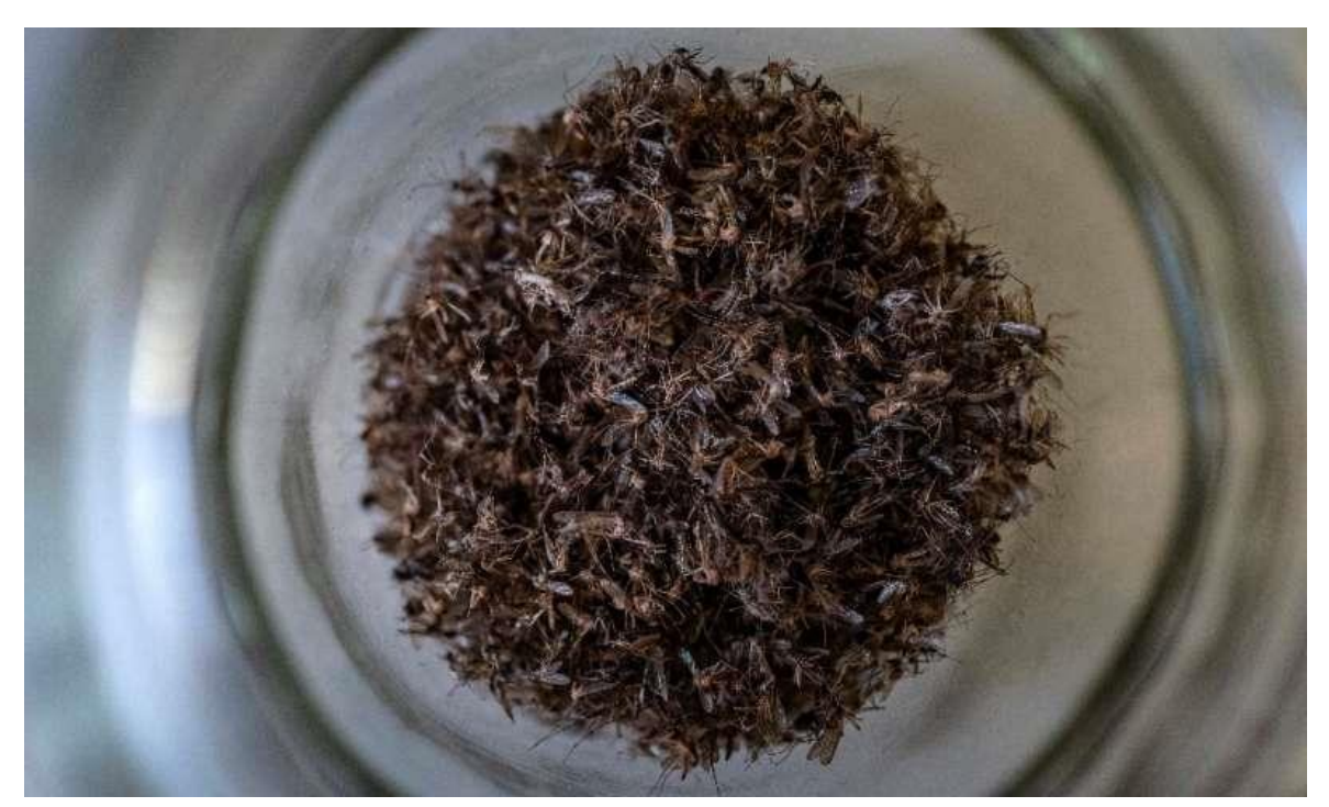
A jar full of dead mosquitoes at a lab researching mosquito-borne diseases at the Friedrich Loeffler Institute