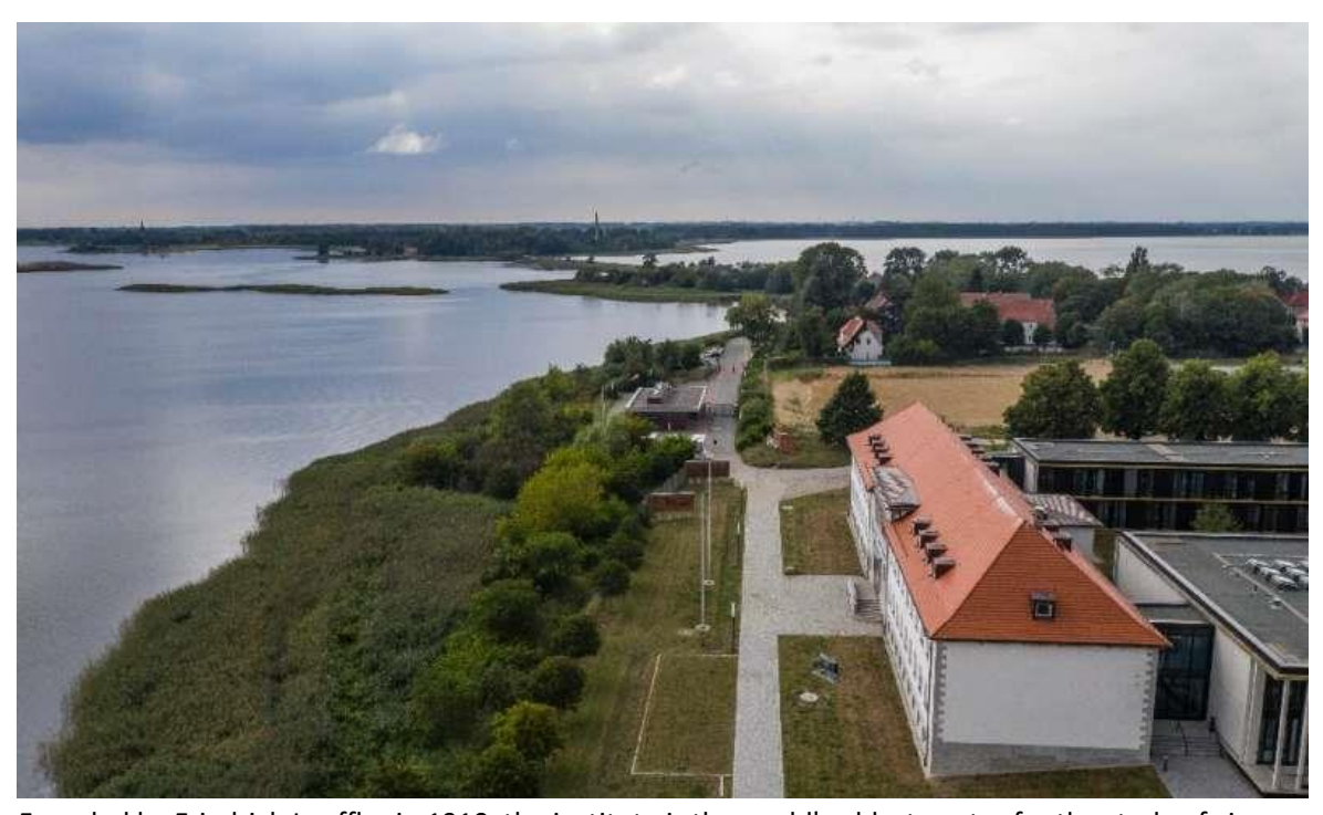
Founded by Friedrich Loeffler in 1910, the institute is the world's oldest centre for the study of viruses