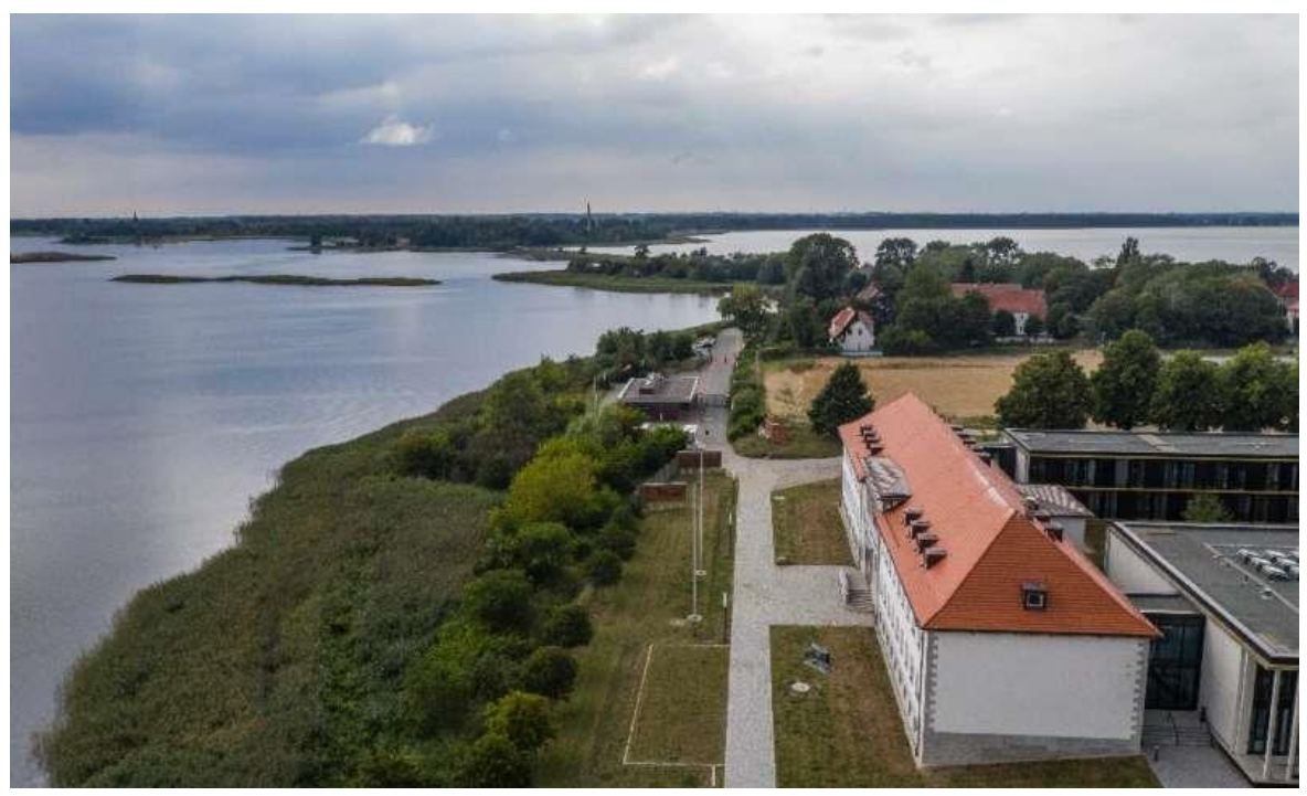
Founded by Friedrich Loeffler in 1910, the institute is the world's oldest centre for the study of viruses