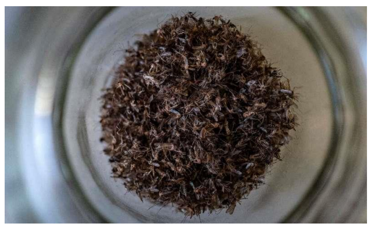
A jar full of dead mosquitoes at a lab researching mosquito-borne diseases at the Friedrich Loeffler Institute