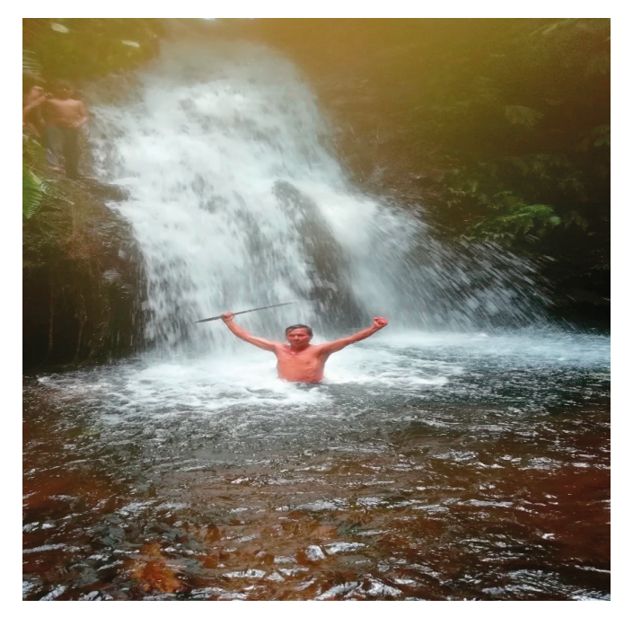
Fig. 3 Nawech during the ritual

"A joyful experience of nature is partially dependent upon a conscious or unconscious development of a sensitivity for qualities" (1989: 51). In fact, this society experiences its engagement with the waterfalls as manifold profound sentiments that go from feelings of suffering and pain during the chants to feelings of joy and strength when arutam's power has been obtained.