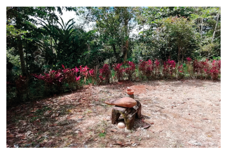
Fig. 1. The ritual circle and "kata" the stone of fertilization.

conceived as a plant of male's virility and manioc as a plant of female's fertility whose power must be assimilated by men and women not only for their biological reproduction, but also for the emphasizing of their gender roles that foster the sociocultural continuity and division of labour of this society.