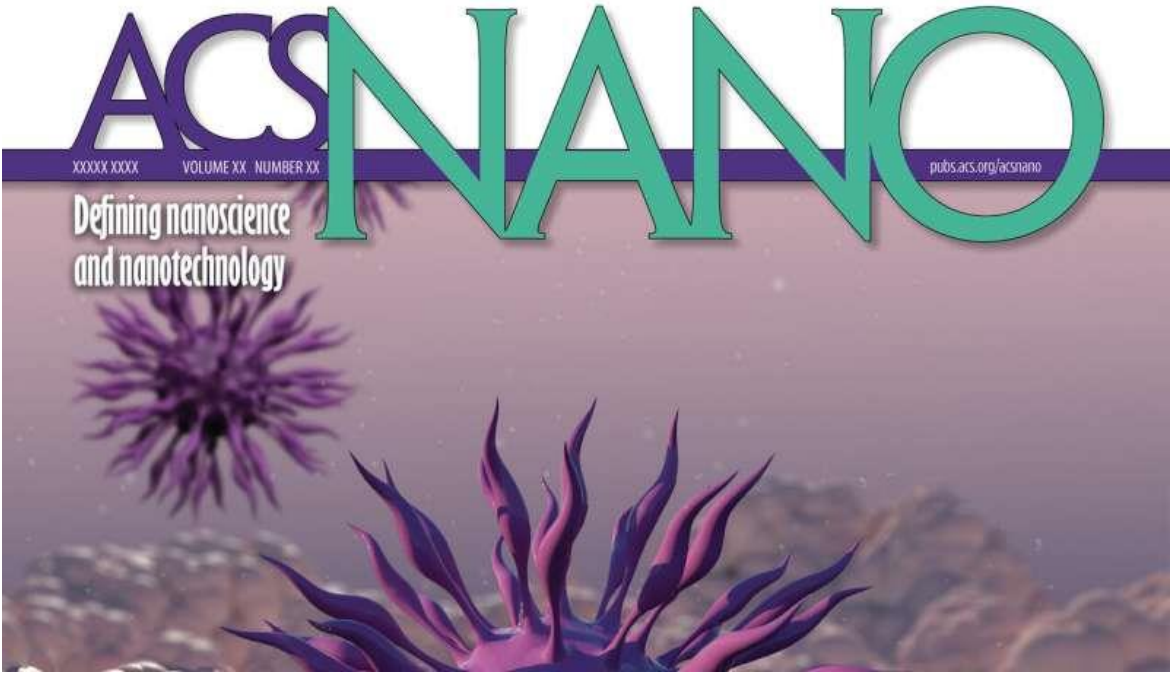
OSU researchers Olena and Oleh Taratula's work with magnetic nanoclusters as cancer therapy was featured on the cover of ACS\ Nano .

Olena Taratula and Oleh Taratula of the OSU College of Pharmacy tackled the problem by developing nanoclusters, multiatom collections of nanoparticles, with enhanced heating efficiency. The nanoclusters are hexagon-shaped <u>iron oxide nanoparticles</u> doped with cobalt and manganese and loaded into biodegradable nanocarriers.