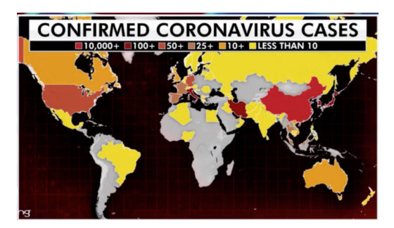
Figure 1 . The distribution of COVID-19 cases as on 29 February 2020 [7].

As we keep searching for case zero in many instances where a sudden development of COVID-19 clusters are seen, the global distribution of cases as it unfolds is worthy of comment. As of 29 February the situation world-wide is displayed in Figure 1.