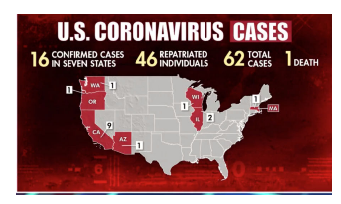
Figure 2b . The distribution of COVID-19 cases as on 29 February 2020 [7].