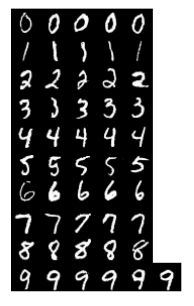
Fig.3 Correct case of Parallel IGC predict. Without noise. Number 9 in right side is the input image.