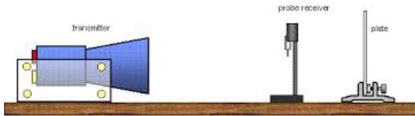
Figure 2 (b)

Let a microwave transmitter and a reflector plate be stationary relative to F_1 . The microwave is emitted in the positive x direction toward the reflector which is in the y-z plane. A standing wave can be formed by adjusting the distance between the transmitter and the reflector until the distance is equal to multiple half wavelengths[1].