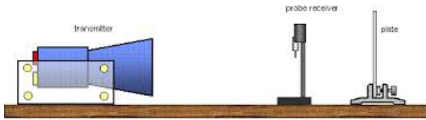
Figure 2 (b)

Let a microwave transmitter and a reflector plate be stationary relative to F_1 . The microwave is emitted in the positive x direction toward the reflector which is in the y-z plane. A standing wave can be formed by adjusting the distance between the transmitter and the reflector until the distance is equal to multiple half wavelengths[1].