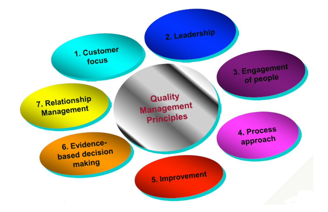
Figure 3. Fundamental principles of ISO 9001:2015

Figure 3 shows the fundamental principles defined in the latest edition of the standard (Biswas, 2018):