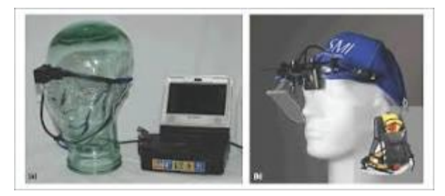
[2] Earlier approaches of eye gaze HCI

The position of eyes is then converted into coordinates. These coordinates are then analysed by the computer to map them with the coordinates on monitor screens. Once the coordinates are mapped, one can easily move the cursor over the screen. IR sensor based which used the corneal based reflection of IR waves were also introduced to improve the accuracy of head mounted eye gaze optical mouse.