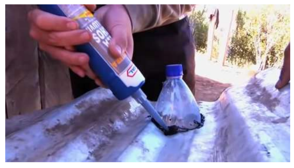
Figure 5. Installation process of Moser lamp (8)