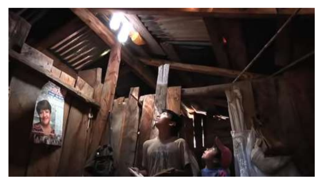
Figure 4. Illustration of Moser lamp (8)

How does it work? The bleach keeps the water from turning green, and the water refracts sunlight. Chilean Miguel Marchand helps to install the bottle lights, or Moser Lamps, in the home of a family that lives in the Andes.