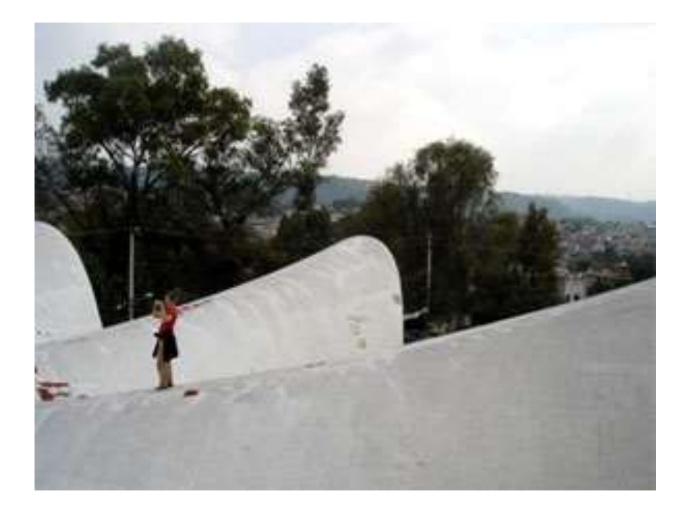
Illustrations 1-3. Several key designs of Felix Candela