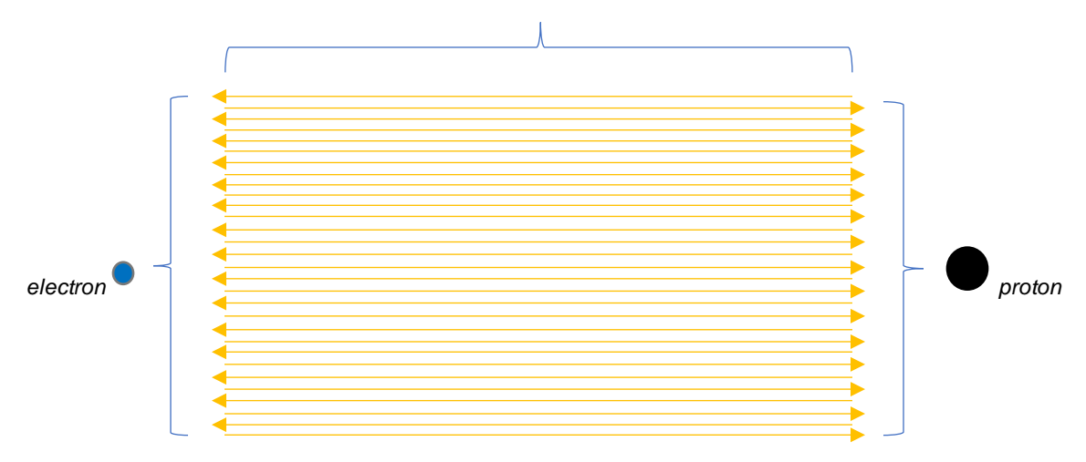
30c Subatomic/elementary functionalities

What also needs to be considered is the condition of the "15" destructive interference sub-levels of the atom, as presented as the elementary destructive interference sublayers of the atomic template from the electron to the proton/neutron. This was presented in paper 2, figures 14 and 16 ([2]: p18 fig14, p19 fig16):