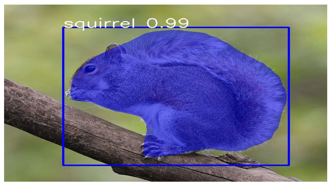
Instance Segmentation with a custom model trained with PixelLib