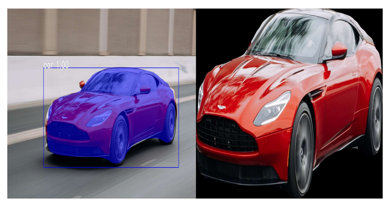
Object Extraction using a pre-trained Mask R-CNN COCO model.