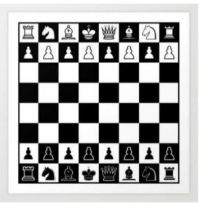
Fig. 4. Is reality closer to a game of chess? Every move references a single consciousness or "action gate"?

In a chess game, we again see a priori rules in a micro-Universe. But the action involves decisions from a conscious decisions-making vertex (our "action gate") that leads to change and play of the game. Each and every play refers back to one of two conscious agents. Perhaps the human affinity with chess originates from a deep analogy to the nature of existence itself. Motion and change in physical space arising from references to a conscious agent i.e., action gate (Fig. 4).