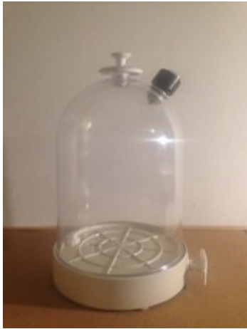
Figure 1. Vacuum chamber with integrated hand pump

plate in which the hand pump is installed. Total height: 34 cm. Diameter of the bell: 20 cm. Plastic bell height: 30 cm.