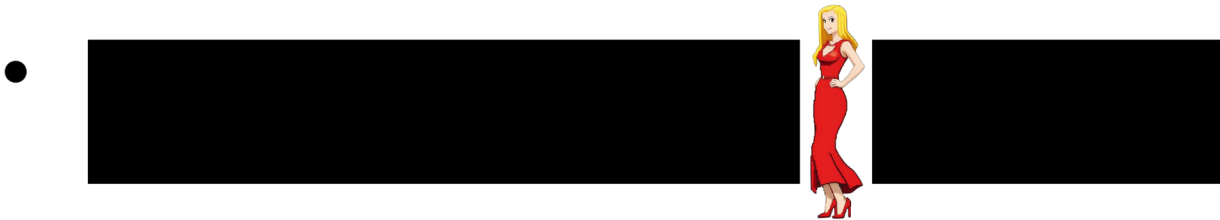
Fig. 1 | Your conscious experience is a simulation. This is an optical illusion. Instructions: close your left eye and use your right eye to focus on the black dot; move your head backwards, or forwards, until the woman in the red dress disappears from your peripheral vision. Does the woman in the red dress actually exist in the physical realm? Or, is she just a figment of your imagination? The rabbit hole goes deeper. Did you notice that the woman was replaced by a false simulation of the two black bars being connected together? The rabbit hole goes deeper. Look at her yellow hair. If you are viewing her yellow hair on a display that uses the red-green-blue (RGB) color model, then the color yellow does not exist on the RGB color display. Thus, the yellow color of the woman's hair only exists in your mind. Is the illusion of the woman's yellow hair color the only illusion that exists in your mind? Or, is everything else in your mind also an illusion? Does the physical realm even exist? Or, is everything just a dream? You will never know because of solipsism. For more information on conscious simulations, see: phantom limb syndrome, "filling-in" of the blind spot, color constancy illusions, hallucinations, dreams, and the cortically induced phosphenes in a retinally blind subject with severed optic nerves 2 . Image of woman generated by non-human intelligence.